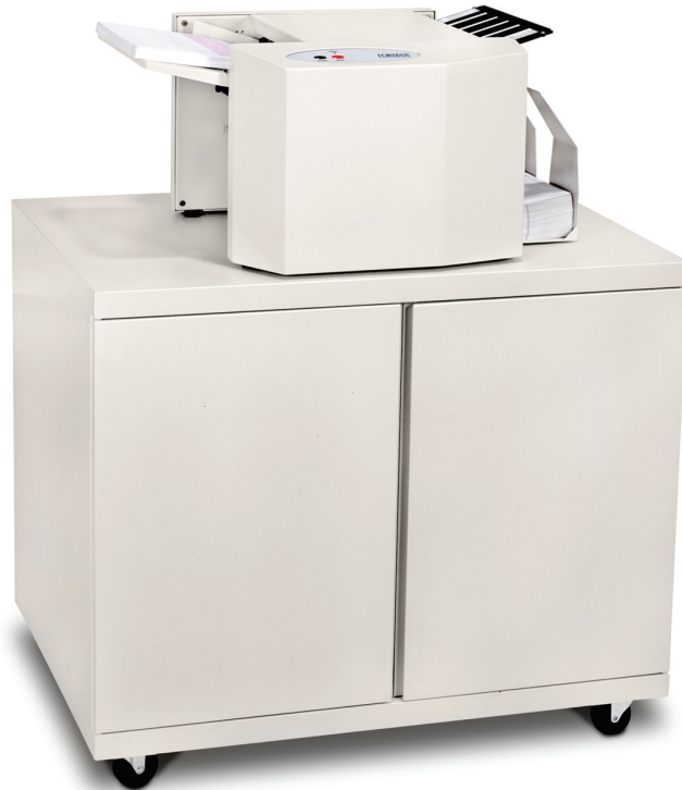
Shown with optional cabinet

The FD 1400 AutoSeal® offers a user-friendly low-volume solution for processing one-piece pressure sensitive mailers. The clearly marked fold plates, control panel, and drop-in feed system provide easy set-up and operation, right out of the box. These features, combined with a sleek desktop design, make the FD 1400 ideal for processing documents in an office environment with low volume applications. With a speed of up to 60 forms per minute and the added capability of processing 14" forms, the FD 1400 enables operators to complete daily processing jobs with ease.